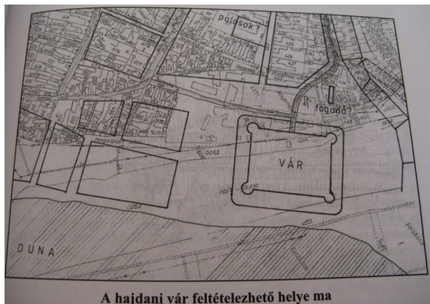
A hajdani vár feltételezhető helye ma